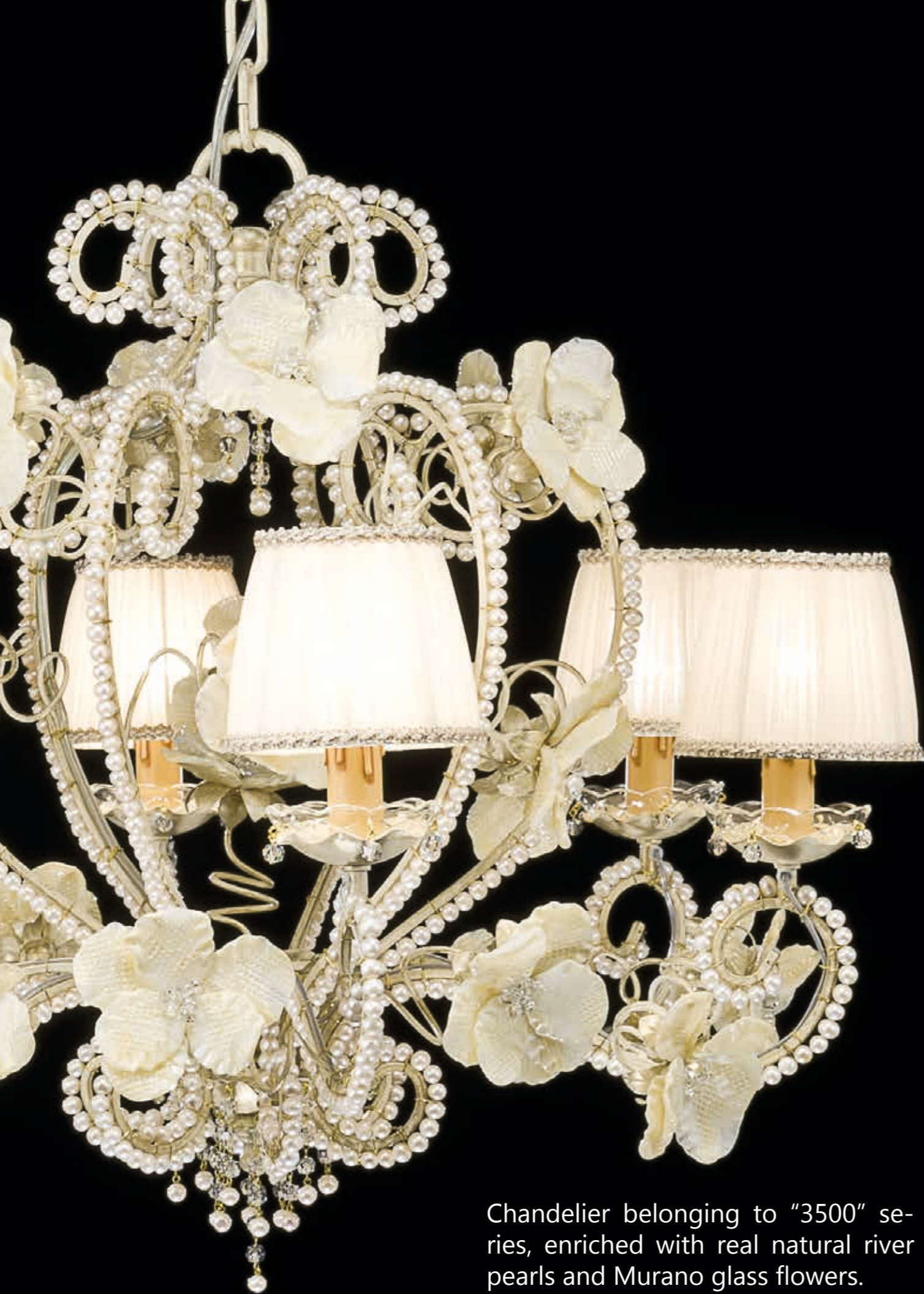
Chandelier belonging to "3500" series, enriched with real natural river pearls and Murano glass flowers.