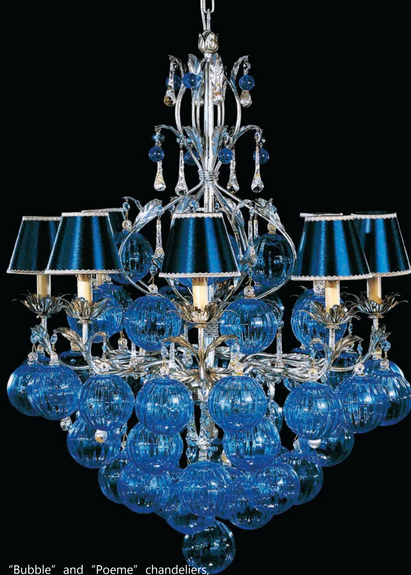
"Bubble" and "Poeme" chandeliers, two of our bestsellers, fully customizable for size, colours and finishes.