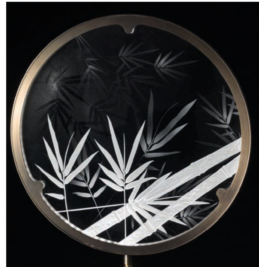
Samples of handmade engraving on Murano glass. Customizable decoration – also upon customer's design.