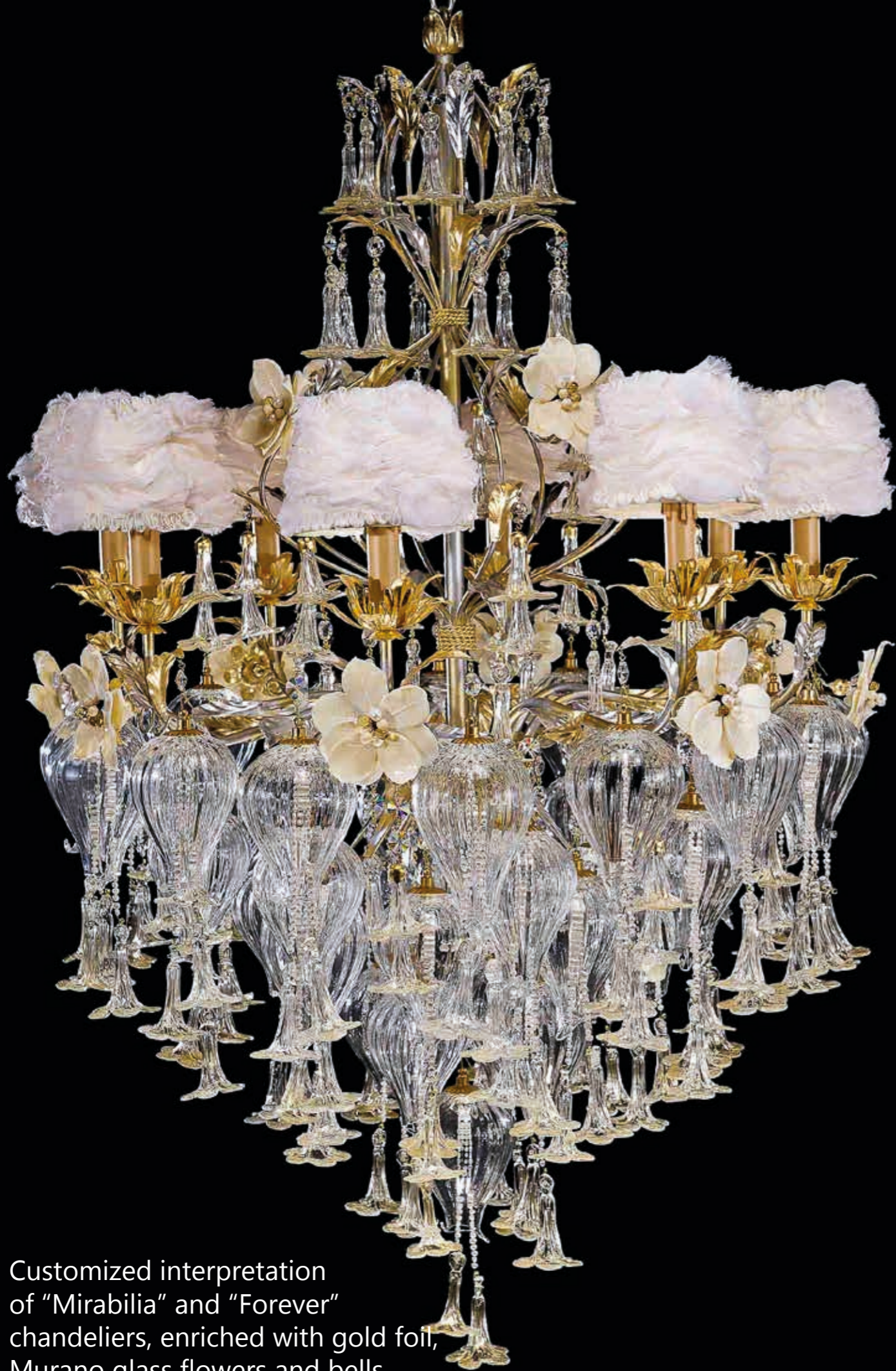
Customized interpretation of "Mirabilia" and "Forever" chandeliers, enriched with gold foil, Murano glass flowers and bells.